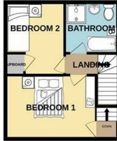
1ST FLOOR 349 sq.ft. (32.4 sq.m.) approx.