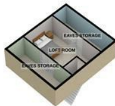
TOTAL FLOOR AREA: 1208 sq.ft. (112.2 sq.m.) approx.

For illustrative purposes only. Decorative finishes, fixtures, fittings and furnishings do not represent the current state of the property. Measurements are approximate. Not to scale. Made with Metropix © 2023