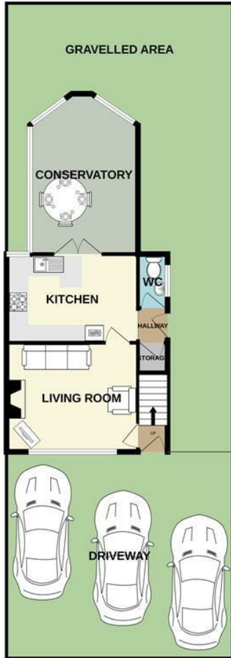
GROUND FLOOR 510 sq.ft. (47.4 sq.m.) approx.